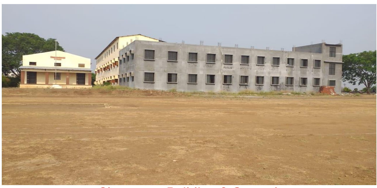
Classroom Building & Ground