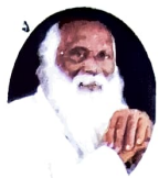
Founder Padmabhushan Dr. Karmveer Bhaurao Patil D. Litt.

"Education Through Self-Help is Our Motto" - Karmveer